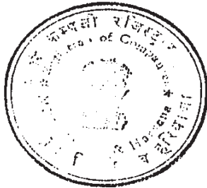
Registrar of Companies National Capital Territory of Delhi and Haryana

Given under my hand at Delhi this NINETEENTH day of JUNE TWO THOUSAND SIX.